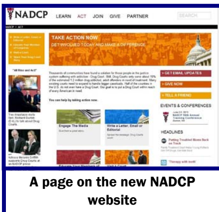
A page on the new NADCP website

The new NADCP website is designed for the Drug Court practitioner, as well as the casual web-surfer to provide the answers and material that are needed by each of these individuals. Someone that goes to the website can now: